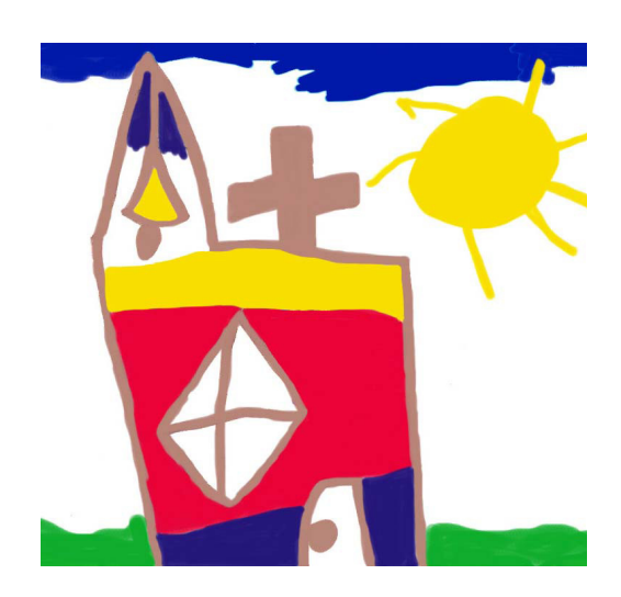
"A child is not a vessel to be filled but a lamp to be lit."