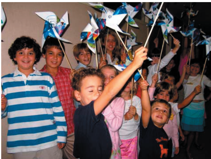
Peace pinwheels to celebrate International Peace Day

The new school year has begun with September's focus on Peace. Students learned about International Peace Day (September 21), and in the Art workshop they made pinwheels out of their drawings of peace – a simple project that children around the world did as well. They also drew pictures of peace images from quotes they discussed. In the Bible Literacy Workshop we discussed “blessed are the peacemakers” and came up with our own characteristics of a peaceful person. Children learned how in everyday life situations there can be positive and peaceful choices to make. October's focus is “The Beatitudes.” Children will become familiar with these through the Art, Bible Skills, Movie, and Story workshops. A big thank you to October's teachers: Annette Grueterich, Ken Hammond, Jennifer Burraway, and Laura Wack.