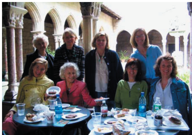
The women of Women's Spirit Rising Bible study group visited the Cloisters in upper Manhattan during their September meeting.

Reserve at church@roundhillcommunitychurch.org or call the Church Office at 869-1091. Childcare will be available with a reservation.