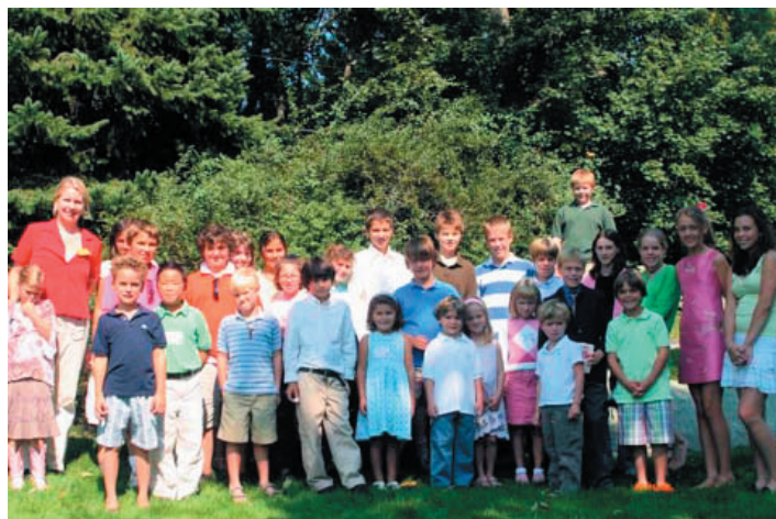
Rally Day at RHCC