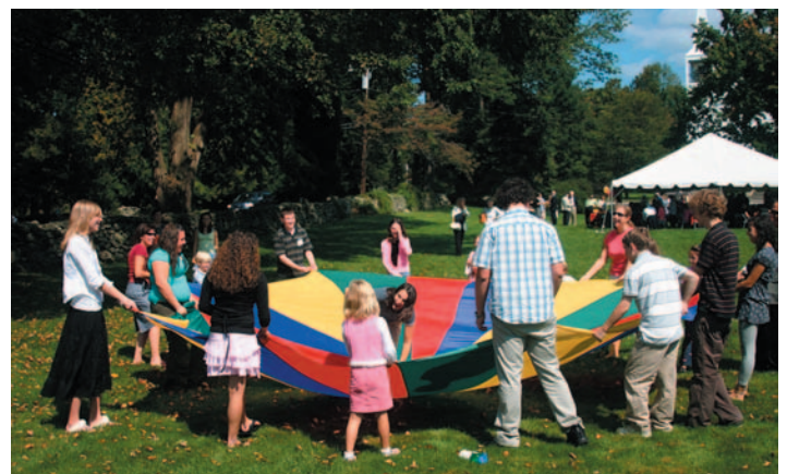
Rally Day 2006

All are welcome. Please invite your friends!