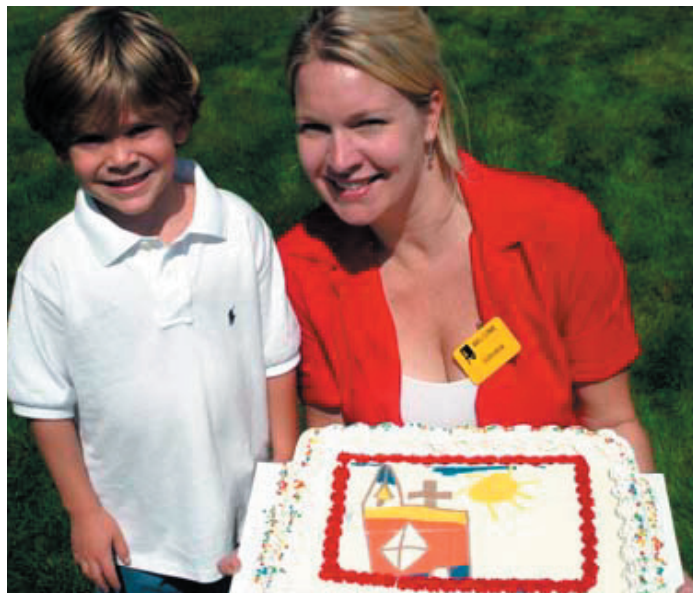
The cake at Rally Day celebrated the official beginning of the Church School year.

will make a difference. Thank you to all who donated to the project – for your financial support, and your support of the Church School program.