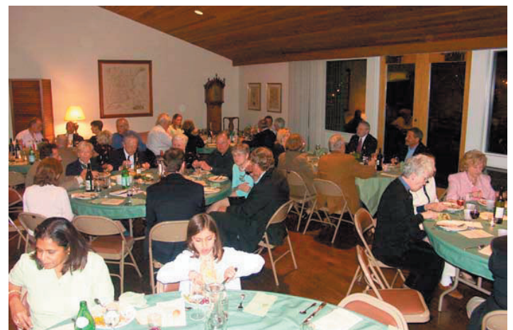
Families and friends gathered in the Parlor for a Maundy Thursday supper after a brief service