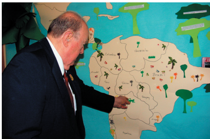
A purchased sticker being placed on the map

The project allowed members to purchase stickers of rain forest animals and trees, which were then placed on a giant map – allowing the rain forests to “grow” with each purchase.