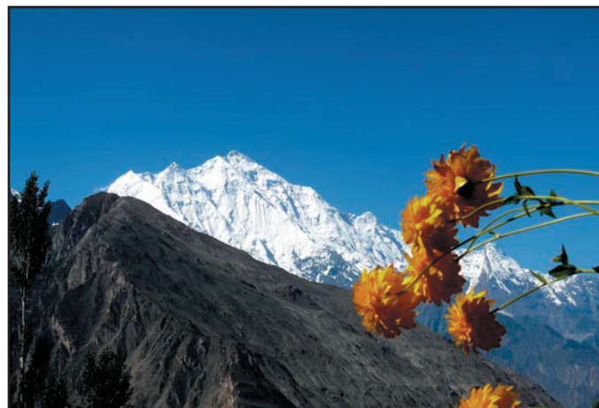
The Karakorum mountains