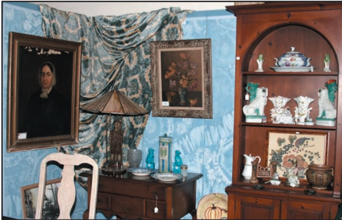
An inviting area of the Treasure Trove