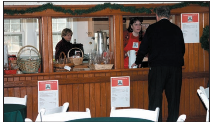
Our café offered warming soups and sandwiches