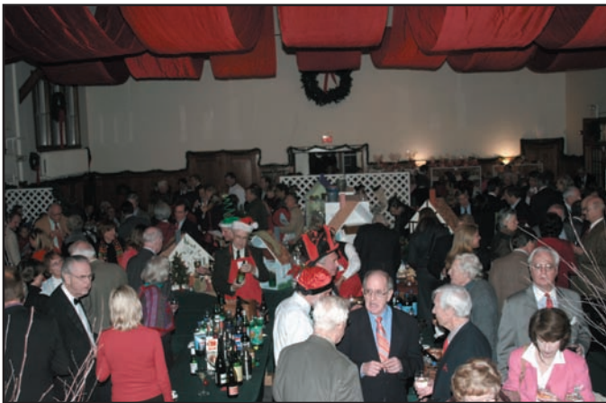
The crowd at the Friday night party