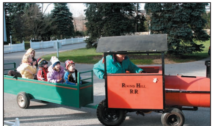
A ride on the Round Hill Express

We appreciate every bit of help that so many people gave throughout the year to make this event such a success and hope to see even more join in for the fun next year.