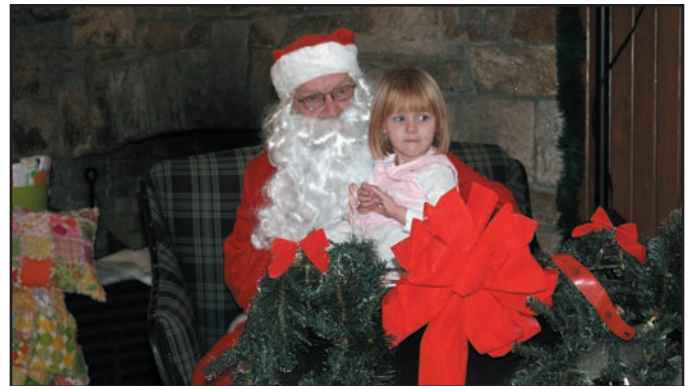
Santa with a visitor